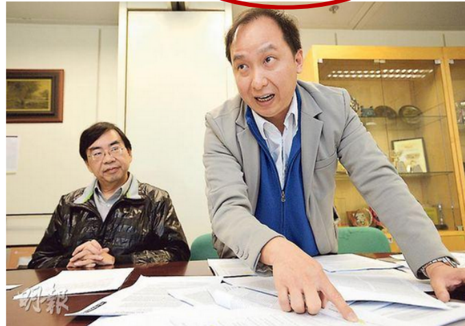
圖4之1 - 捲入抄襲質疑的理工大學論文共有3名作者，其中兩人分別是理大工.....